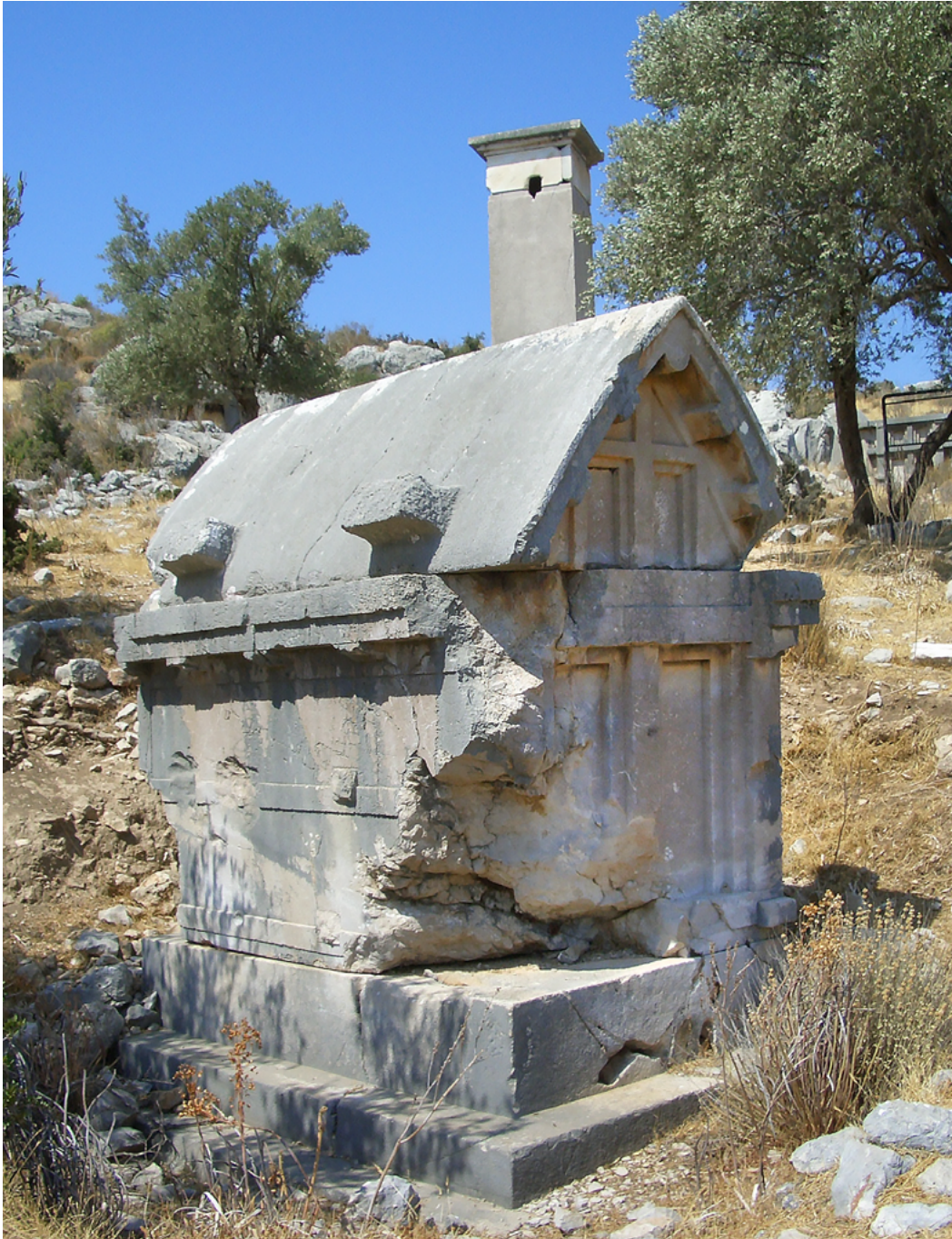
Fig. 3: Sarcophagus at Xanthos imitating wooden architecture

Subsequently, these Lycian building elements merged with Greek ones, which were also borrowed from wood construction. These Greek elements, which are mainly found on the chests, are not rooted in house architecture, but in construction principles of wooden chests. This development probably started in the 2nd half of the 5th, to reach its peak in the 4th century BC. Sarcophagi of both types seem to have existed parallel to each other, whereby the elements that go back to one or the other wooden construction often degenerated into rudiments or were even left out.