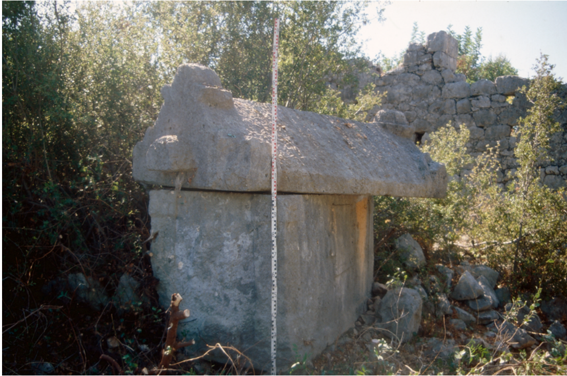
Fig. 5: Sarcophagus with gabled roof-shaped lid in the necropolis of Teimiussa

Furthermore, at Olympos, the ναύκληρος Eudemos chose a sarcophagus with a non-ogival but flat lid with a triangular pediment for his sarcophagus, in which he was buried in the tomb of his nephew M. Aurelius Zosimas. 46 His epitaph provides an insight into the world of these people. Eudemos was engaged in the regular exchange of goods with the Black Sea region, and he himself crossed the Bosphorus several times. Which goods he transported there and from there back to Lycia can at best be discovered indirectly, but it will primarily have been agricultural products. 47 In any case, Eudemos was extremely successful in his trade, which, in addition to high local offices, earned him citizenship of Bithynian Chalcedon, and which he proudly states as the primary source of his wealth.