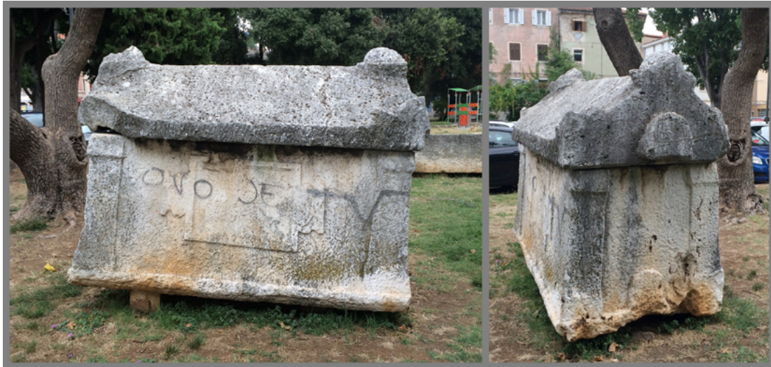
Fig. 1: Sarcophagus from Andriake, set up in the Park grada Graza at Pula

In the center of the Croatian town of Pula, visitors find an ancient sarcophagus with a gabled roof-shaped lid in the Park grada Graza (Park of the City of Graz). Since there are other parts of sarcophagi and workpieces in the park, it appears that these and the sarcophagus may be remains of the Roman Colonia Iulia Pola Polensis Herculanea and come from its necropolis. 1