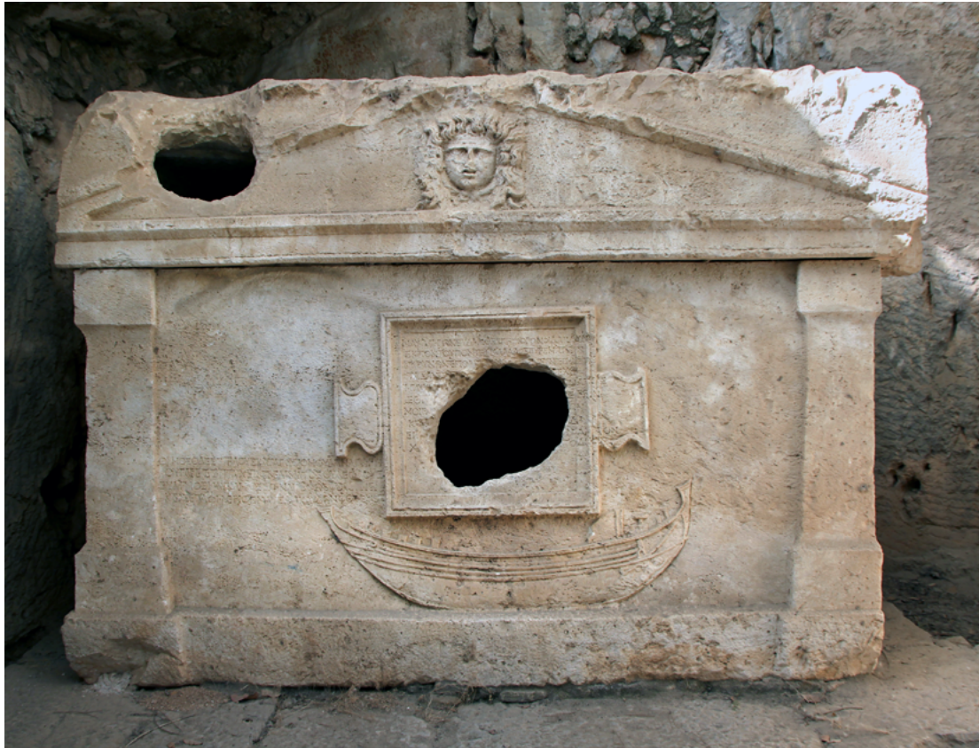
Fig. 6: Sarcophagus of the shipowner Eudemos at Olympos

In spite of these individual examples, other foreigners who died in Lycia or local people associated with long-distance trade seem to have chosen sarcophagi with the local ogival lid for their burial. At least, that is shown by the sarcophagi of the foreigners from Selge, Byzantion, Caesarea Maritima and Puteoli in Timiusa with corresponding lids. A reverse example, however, is the sarcophagus of a Konon from Myra. 48 It is located in the necropolis of Andriake and has a lid in the form of a gabled roof. The same applies to the sarcophagus of Pardalas, which comes from the same necropolis, and the story of whose transfer to Pula was recounted at the beginning of this article.