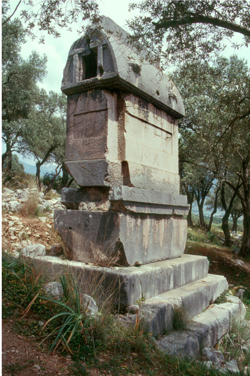
Fig. 4: Sarcophagus of Ahqqadi at Xanthos with the chest imitating a wooden box

The most striking feature, the ogival shape of the lid, was always retained, even if the decoration of the gable fields was often reduced to a single projecting element for lifting the lid. 13 Unlike the other pre-Hellenistic grave types, the sarcophagus can also be traced through the entire Hellenistic period.